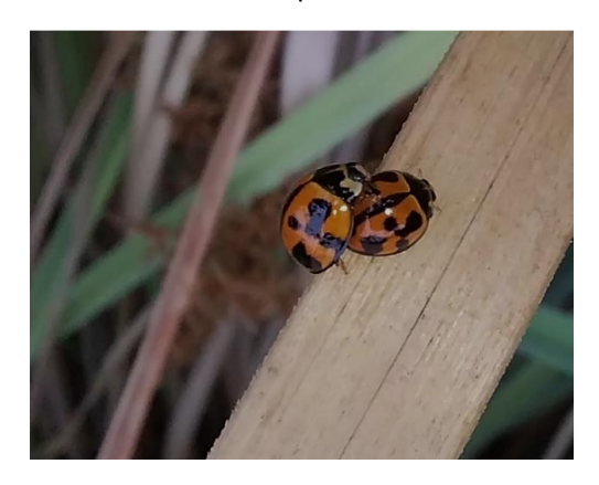
Adult Variable Ladybirds mating on leaves

The Variable Ladybird ( Coelophora inaequalis ) or common Australian lady beetle is an extremely useful insect to have in your garden or on crops. This 5mm ladybird is orange-red with black dots on its outer wings which are variable in shape and number (reflecting its common name). The beetles have a thorax and a black line running down the centre of them where the two wings meet in the middle. Although this appears to be the dominant colour pattern in the Cook Islands, variations are seen elsewhere including Australia, New Zealand, South-east Asia and parts of South and Central America.