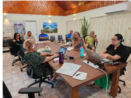
Group photo from Working Group Session 2