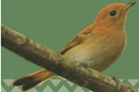
- Kakerōri Rarotonga Flycatcher Pomarea dimidiata

The overall objective of the TCA is to conserve plants and animals and their surrounding environment for the benefit and enjoyment of present and future generations of the Cook Islands.