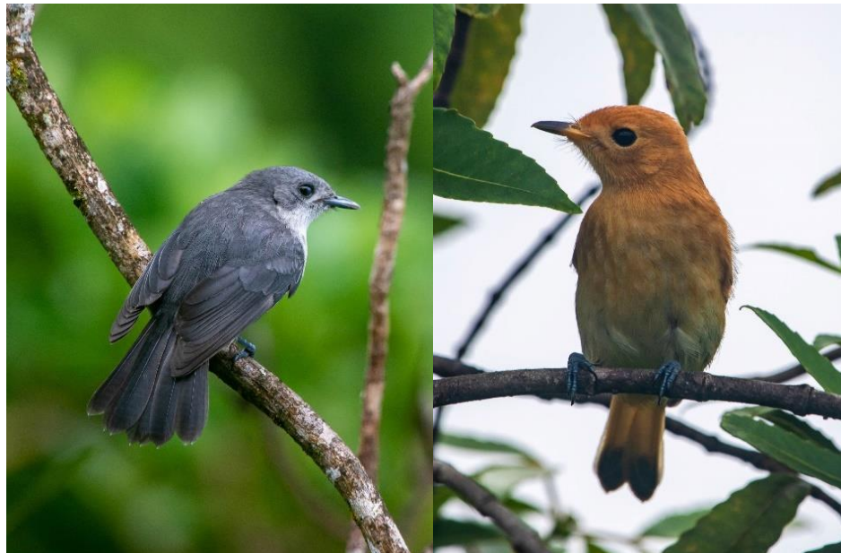
Kākerōri (Rarotonga Flycatcher, Pomarea dimidiata ) adult and juvenile, Julien Ueda (2019)

All rights for commercial reproduction and/or translation are reserved. The Cook Islands NES authorises partial reproduction or translation of this work for fair use, scientific, educational/outreach and research purposes, provided NES and the source document are properly acknowledged. Full reproduction may be permitted with consent of NES management approval. Photographs contained in this document may not be reproduced or altered without written consent of the original photographer and NES.