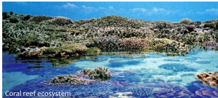
Coral reef ecosystem

Impacts on Food-Webs: Many species including corals, snails and krill are dependent on aragonite and calcite concentrations in the water. As oceans acidify, these minerals will become less abundant and species will struggle to mineralise their exoskeletons. Severe impacts will be felt within polar regions, with aragonite undersaturation expected to occur as early as 2016 40 and both calcite and aragonite concentrations expected to be insufficient for mineralisation in Arctic waters by 2060 41 . This will have serious consequences for the entire ecosystem, as species dependent on these minerals form the basis of food webs in these regions. As zooplankton composition and abundance is expected to change 39,42,43,44 , species directly or indirectly dependent on these (e.g. whales, dolphins) are likely to suffer 25 .