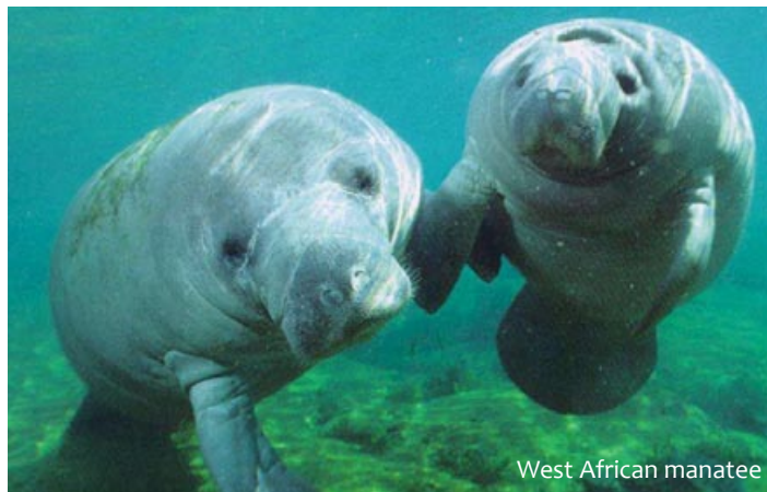
West African manatee

More erratic weather regimes, which increase the incidence of phenomena such as hurricanes, droughts and floods, are predicted to become more frequent 25 . This is likely to increase the vulnerability of many species in the future. Half of the CMS Appendix I species studied to date have been identified as vulnerable to increased incidences of extreme weather, mainly through direct impacts on mortality rates.