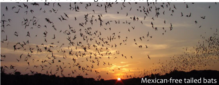
Mexican-free tailed bats

With carbon dioxide emissions already reaching 387ppm and causing significant and irreversible ecosystem change, it is evident that emphasis needs to be placed not only upon mitigation of greenhouse gas emissions, but also on maximising the adaptive potential of migratory species populations.