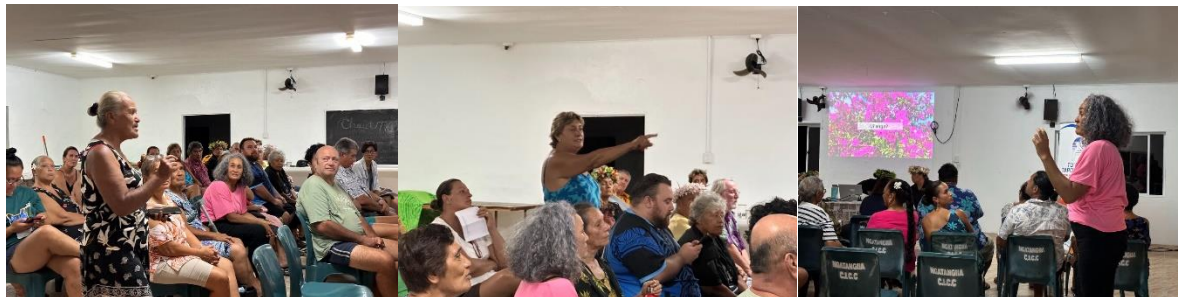
Figure 8. Community members during the Open Floor session for Questions