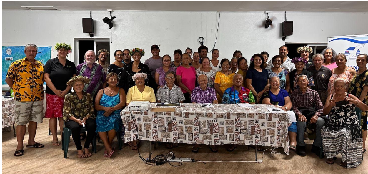
Figure 11. Group photo to commemorate the families giving consent for the TCA to be submitted for recognition as an OECM

Munro acknowledged the support of SPREP and NES staff for helping the families receive the OECM recognition for the TCA. The community meeting was closed with a prayer and a final group photo was taken (Fig. 11).