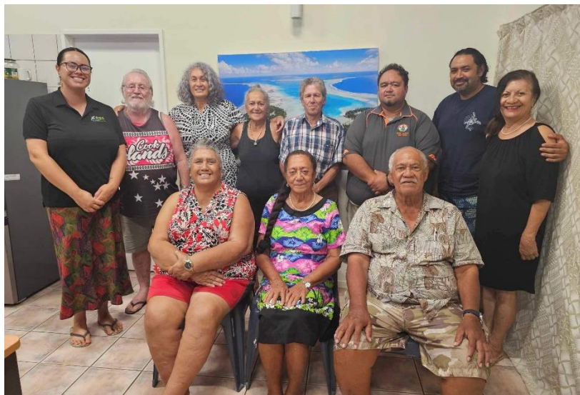
Figure 1. Some of the TCA OECM Working Group members

For more information on the National OECM Workshop held in January 2023, the TCA Community workshop held in November 2023, and the Working Group meetings, see the National Environment Service website https://environment.gov.ck