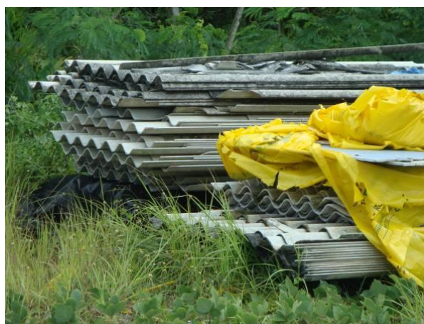
Examples of asbestos used in construction in the Pacific islands.