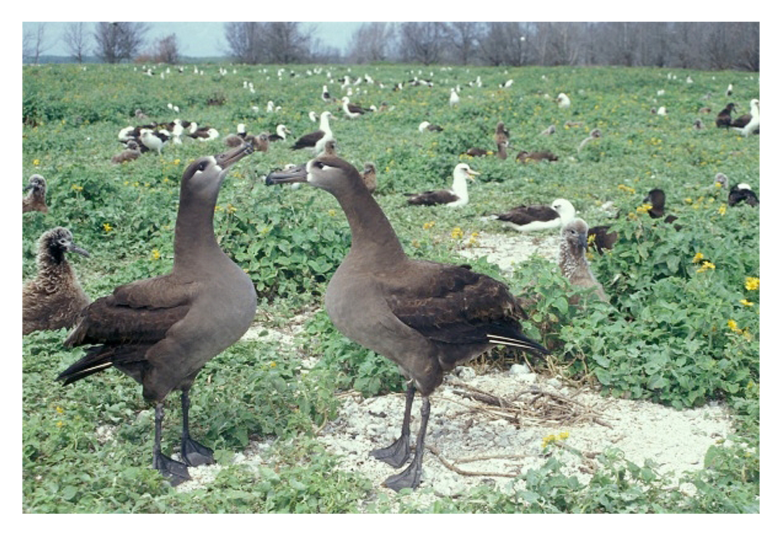
FIGURE 3. A field of Verbesina encelioides (golden crownbeard) on Eastern Island (Midway Atoll, Hawai'i) with a pair of black-footed albatross dancing in front of some Laysan albatross.

Verbesina encelioides, Pacific Island Invasive Species · Feenstra and Clements