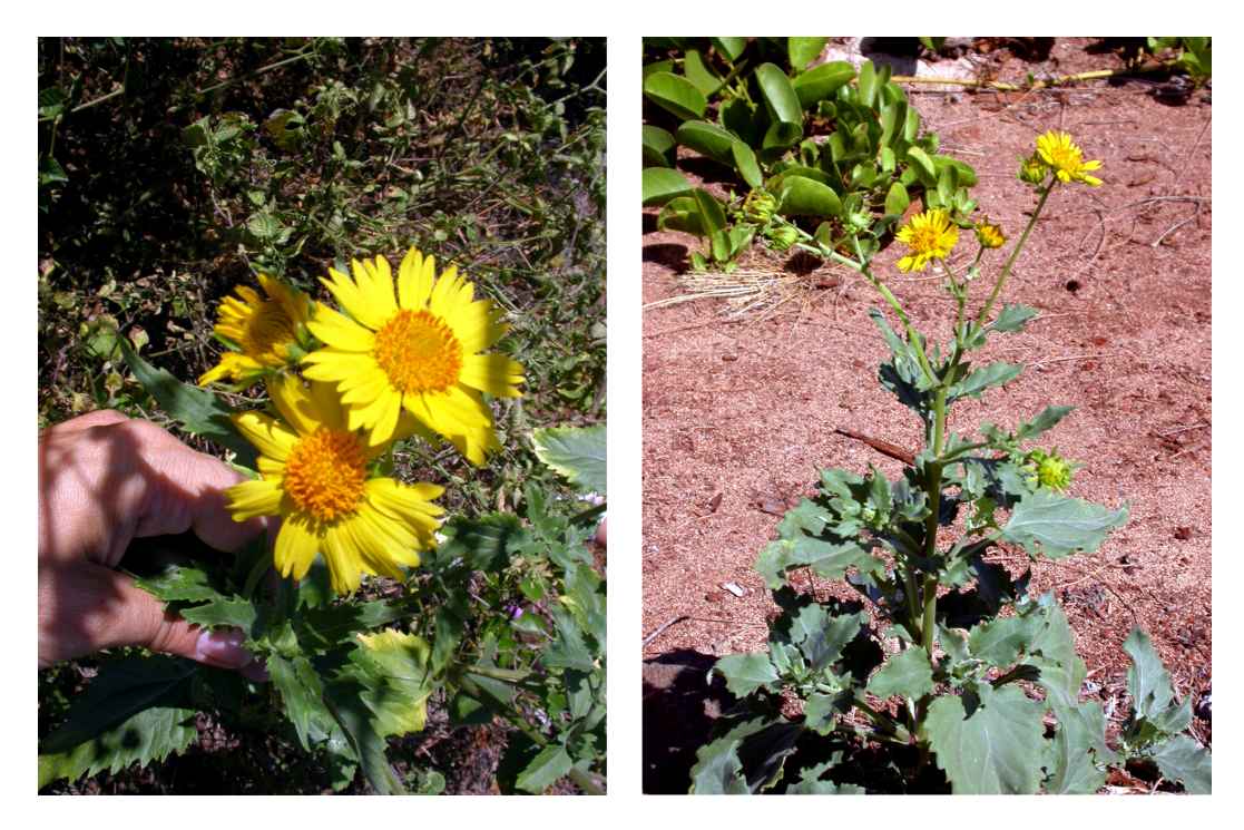
FIGURE 1. Verbesina encelioides (golden crownbeard) growing at Kanahā Beach Park near Kahului, Maui, Hawai'i.

Common names: golden crownbeard, crownbeard, golden crown daisy, wild sunflower, cowpen daisy, girasolcito, anil del muerto, yellowtop, American dogweed, butter daisy, South African daisy.