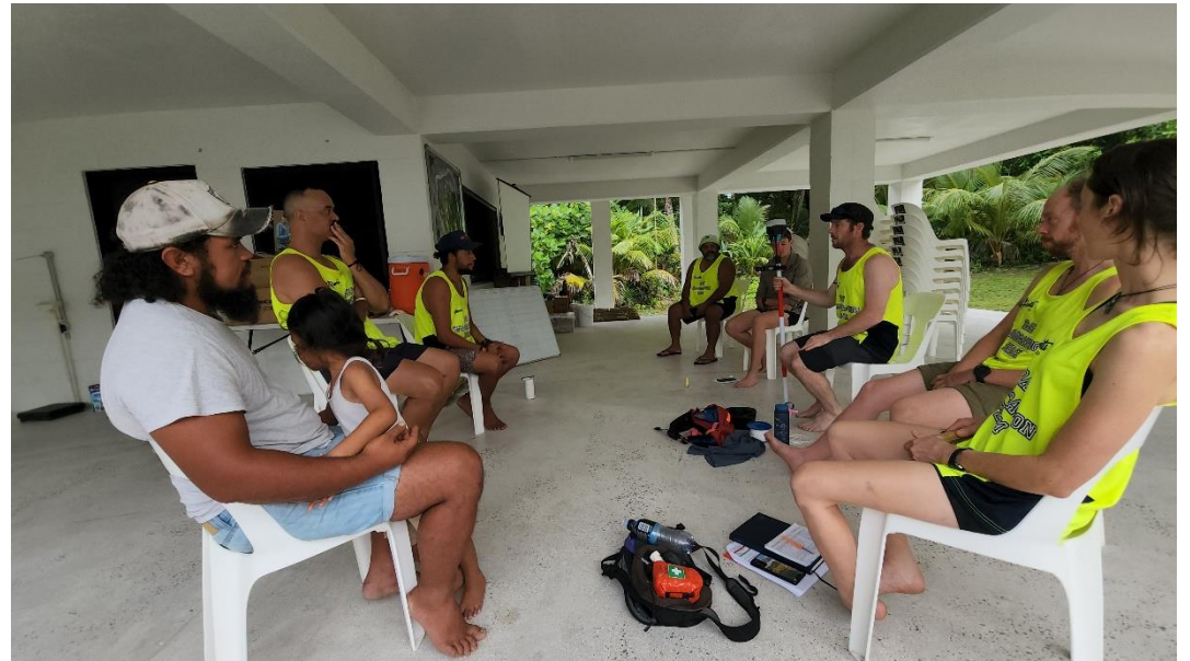
Left: Briefing our tasks for the day